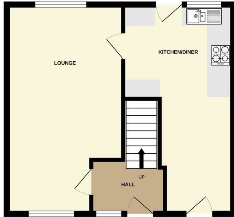
GROUND FLOOR 441 sq.ft. (41.0 sq.m.) approx.